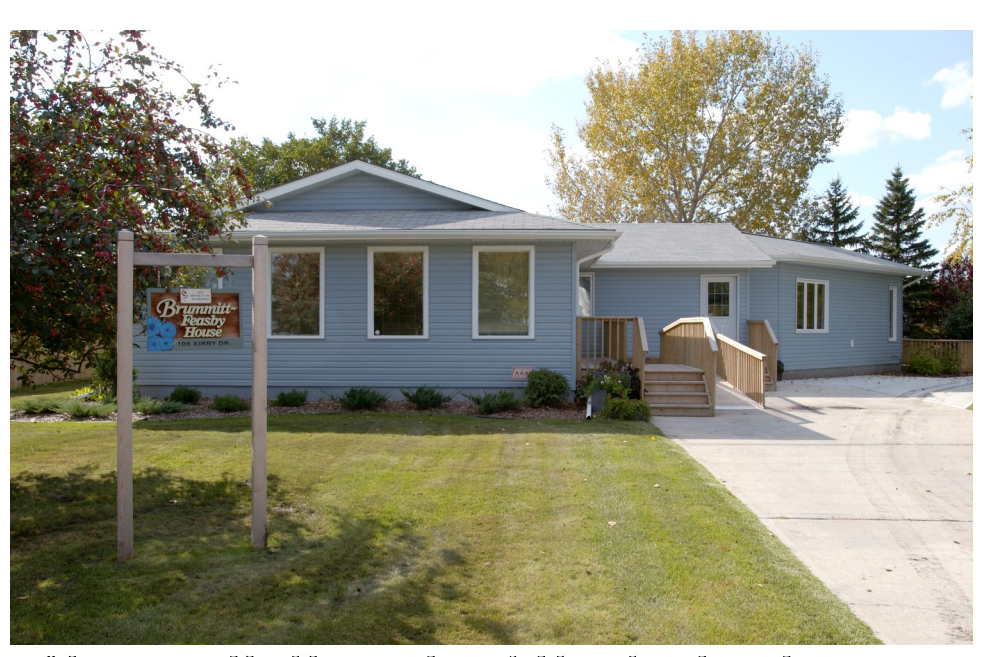
"The nurses and health care aides work diligently and provide exceptional care to every individual, meeting each person's unique needs."